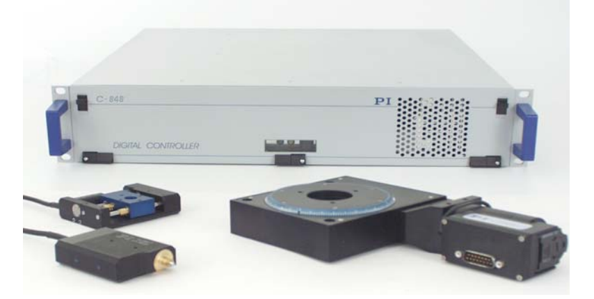
Fig. 1. C-848 DC-motor controller with a selection of stages

For position feedback, incremental rotary or linear encoders can be used. Many standard PI motors provide resolutions of 2048 counts/rev and are well suited for high-resolution positioning. Even better absolute position accuracy can be achieved with linear incremental scales, available some M-500 and other stage series.