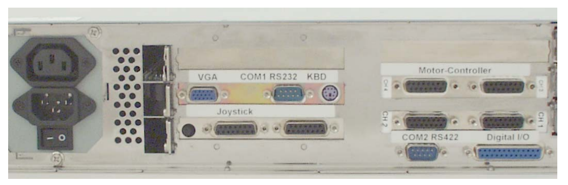
Fig. 5 C-848 rear panel; current and future versions lack the joystick connection

All connections are on the rear panel. They include the power connection, the connection to the host computer (RS-232, RS-422 and, if present, joystick and/or an IEEE 488 GPIB port), digital I/O for external signals and a connector for each controlled motor. There are also connectors for a keyboard and VGA monitor. Keyboard and monitor are not normally required, but may be useful if problems occur. Pinouts are industry standard.